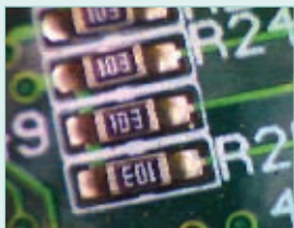
PC board inspection