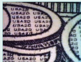
Check for counterfeit money