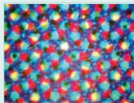
Analysis of printing