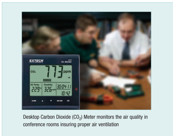
Desktop Carbon Dioxide (CO 2 ) Meter monitors the air quality in conference rooms insuring proper air ventilation