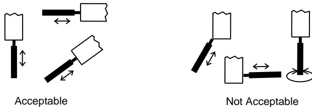
Figure 1 – Correct and Incorrect Angles of Measurement

Note: The sensing head with adapter must be in line with the object being measured. Avoid rotating the sensing head. Refer to the figure below.