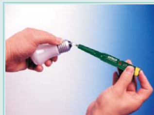
Light Bulb Continuity Check