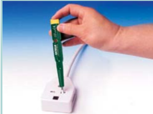
Voltage check in an outlet