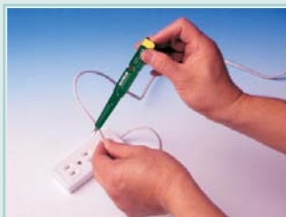
Checking for open wires in cables