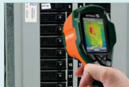
Detect hidden problems fast