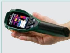
Pocket sized and extremely lightweight—only 12 ounces

Complete with 512MB microSD Card, miniSD™ adaptor, Li-Ion rechargeable battery with 90-260V AC adaptor/charger with EU, UK, US and Australian plugs, QuickReport™ software with USB Mini-B cable, built-in manual lens shutter, hand strap, and protective hard carrying case