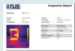
QuickReport™ PC software enables user to analyze Temperature of all JPEG images from microSD card